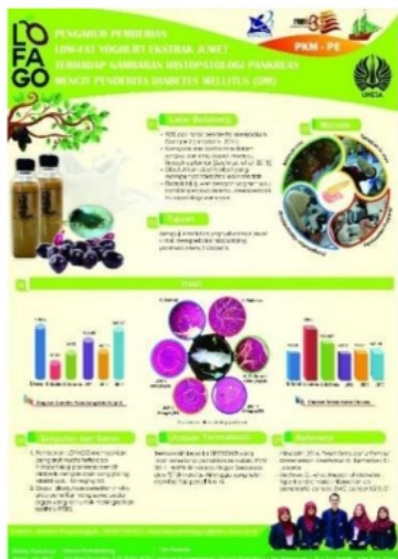
Fig 1. Example of poster in National Scientific Fair 2017 presented by PSTs

plays an important role in facilitating students' thinking to realize their creative ideas. The emphasis is through combining disciplines and step-by-step mentoring.